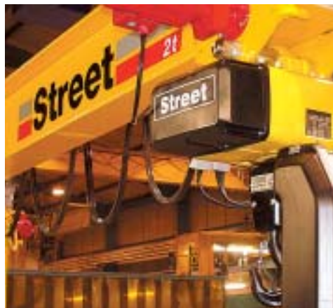
Overhead Crane Application

A technical data book on Street hoists and components is available on request.