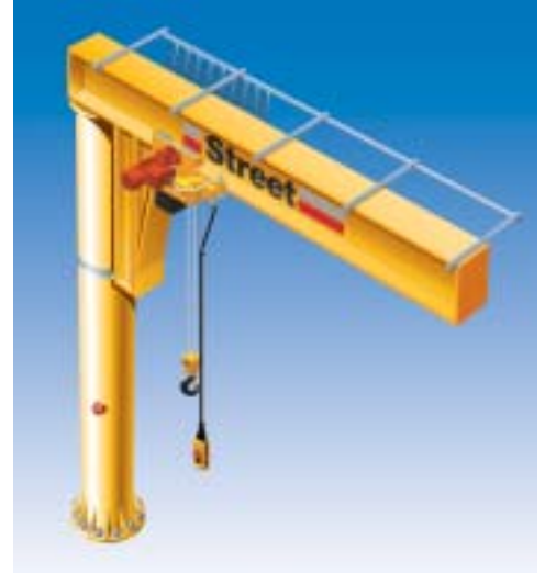
Pillar Jib Application

This new generation of chain hoists sets the standards for lifting and material handling beyond the millennium. We understand the challenges our customers face in this rapidly changing world, where increased competitive pressure will mean only the most productive will prosper. Increasing the efficiency of load lifting and material handling will be critical to overall productivity and the CX chain hoist is designed to meet these future demands and provide greater benefits to the user.