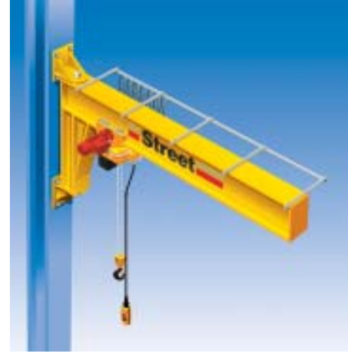
Wall Mounted Jib Application

CX chain hoists represent only a part of Street Cranes' hoist manufacturing programme, which includes the ZX and TVX wire rope hoists in capacities up to 200t.